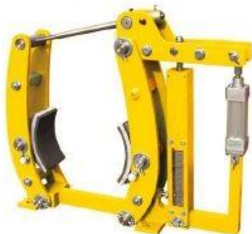
Pneumatic or hydraulic actuator